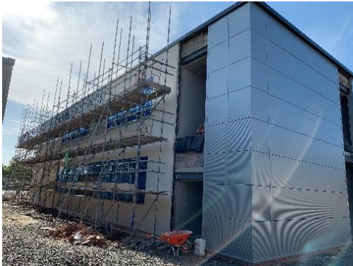
View from Sports Hall side

You will note from the pictures below that our planned new English block is on track for completion in September. It is located between the Sports Hall and Science Block, connecting directly through to the latter on both floors. This is a very exciting development for the school; providing modern teaching facilities in an 8 classroom block, together with more unisex toilets, a small group intervention space and a brand new library.