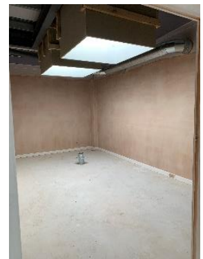
Small group space