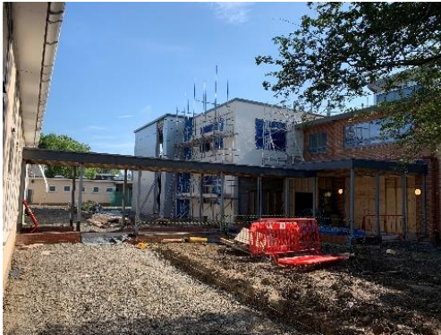
View from Science Block side